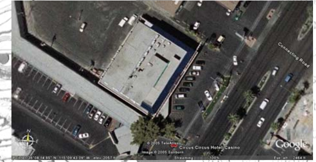
"The Possibility that any freak with $1.98 can walk into the Circus-Circus and suddenly appear in the sky over downtown Las Vegas twelve times the size of God, howling anything that comes into his head. No, this is not a good town for psychedelic drugs. Reality itself is too twisted" (47)