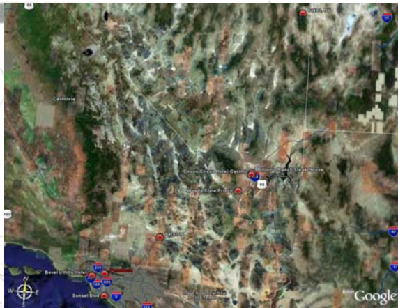
Google Earth Map of towns and businesses where HST's problems with America were expressed. Note that Binion's Ranch Steak House is what replaced the Mint Hotel, where Raul Duke and Dr. Gonzo stay in the novel.